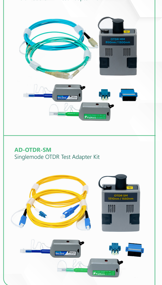
AD-OTDR-MM Multimode OTDR Test Adapter Kit

SCAN QR CODE to watch demo video of OTDR Test Adapters