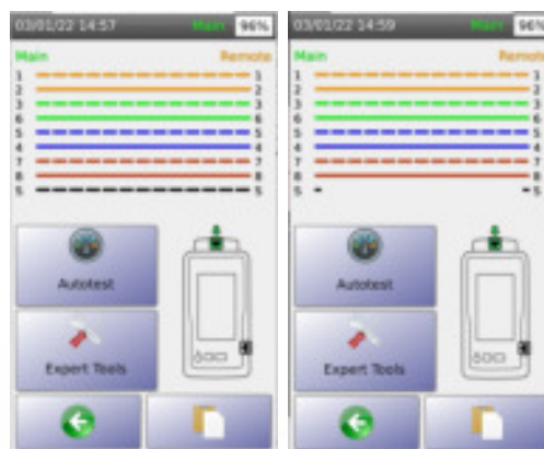
Fig 2 – Cable with good shielding and broken shield (DC shield discontinuity)

Although the technical details of measurement methods employed to detect shielding errors are beyond the scope of this document, here we describe the overall idea about how the testers perform the shield measurements.