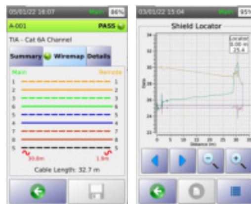
Fig 3 - Cable with AC shielding discontinuity and its time domain locator plot

common mode signal can be viewed as injecting noise on purpose. The instrument then analyses reflected signal by adding the voltages on the two wires instead of usual subtraction (as noise is what we are interested in for the purpose of this measurement). It then finds magnitude and delay of this reflected common mode signal. A strong reflection means discontinuity in the shield. The delay associated with this strong reflection represents the location of the discontinuity.